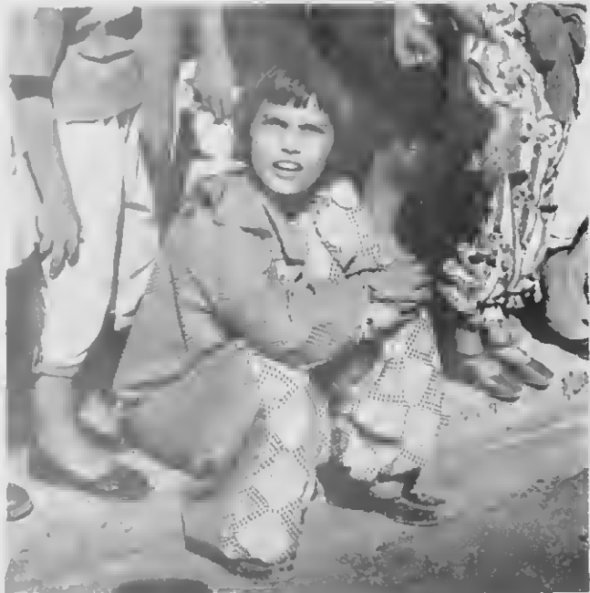
UN OBSERVADOR bisti den su traje di carnaval ta mira cu masha atencion.